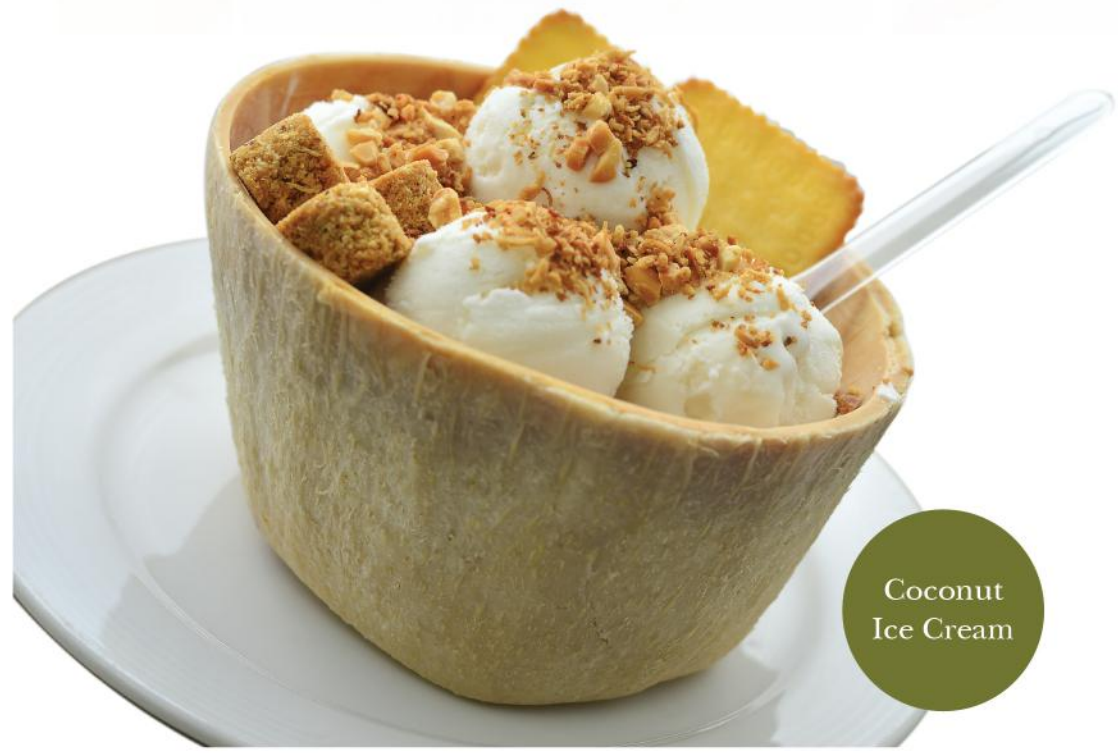
Coconut Ice Cream