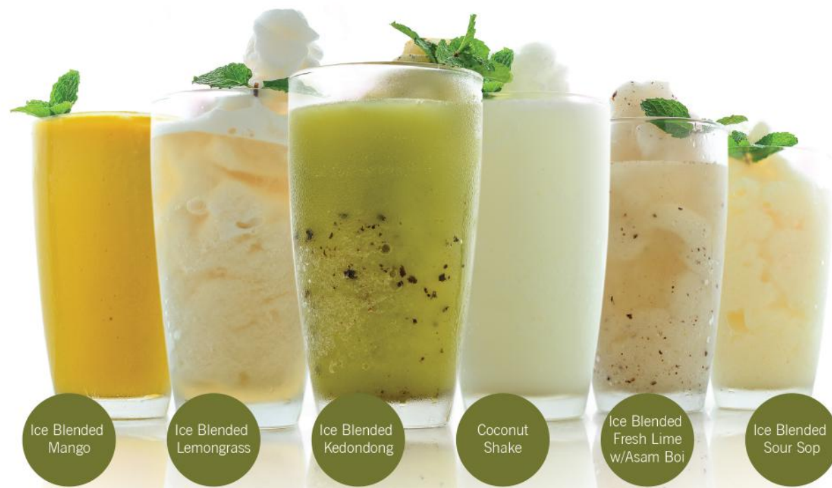
Ice Blended Mango